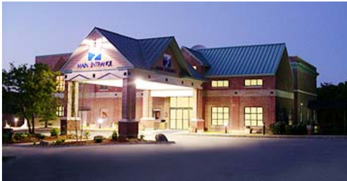
Springfield Hospital Main Entrance

Springfield Hospital is a certified critical access hospital servicing communities in southeastern Vermont and southwestern New Hampshire. Dufresne Group was hired to design a project that would alleviate existing maintenance requirements for access and snow removal for the existing hospital site. The project consisted of existing parking lot expansion and new access roads. The project created 60 new parking spaces.