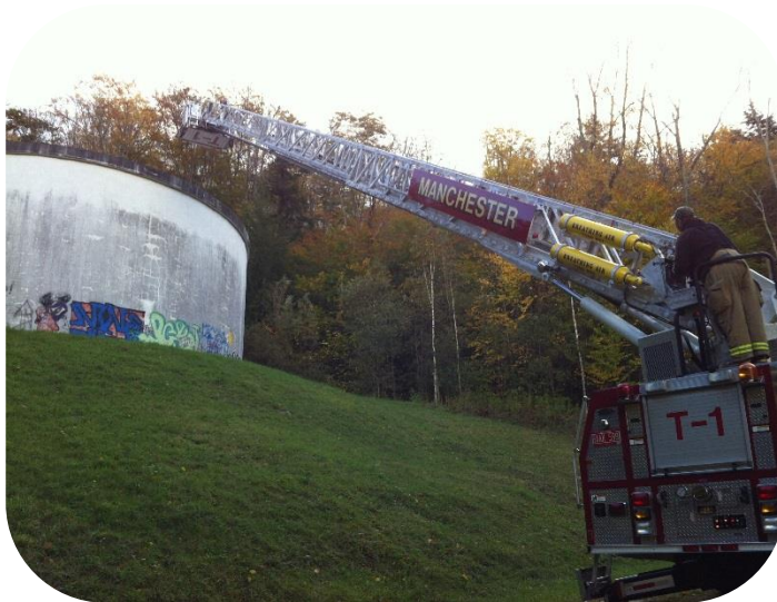
Tank Level Measurements in Progress