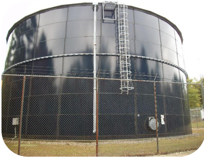
Existing Storage Tank